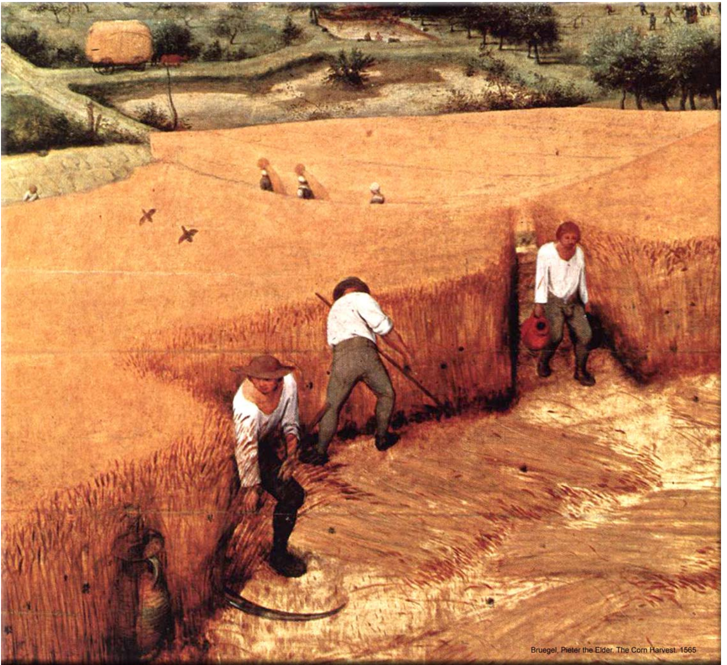
Bruegel, Pieter the Elder, The Corn Harvest, 1565

Since you were faithful in small matters, I will give you great responsibilities. Come, share your master's joy.