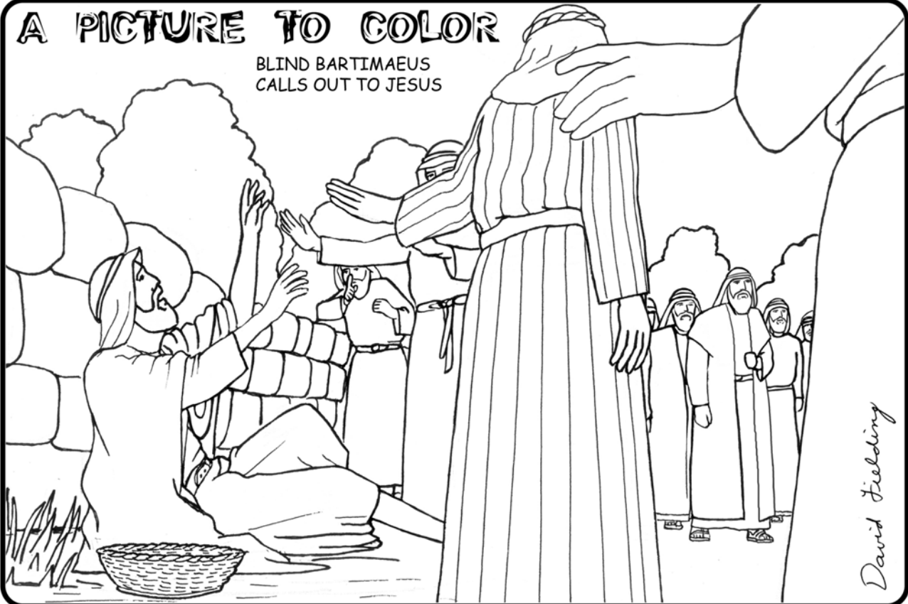
BLIND BARTIMAEUS CALLS OUT TO JESUS