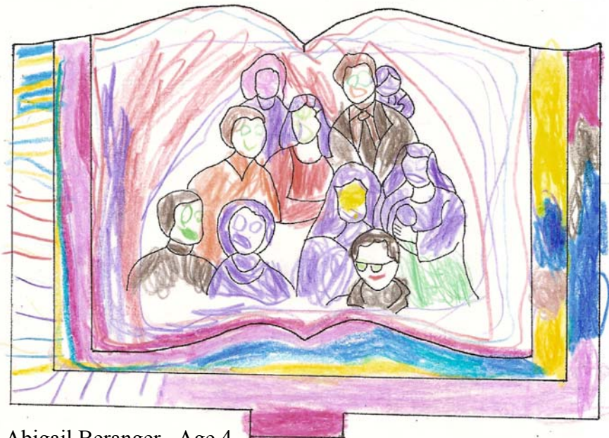
Abigail Beranger Age 4